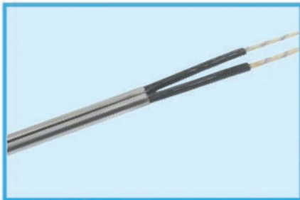
A1 Style: High temperature fiberglass leads straight