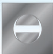
Energized Expandable Cartridge Heaters

www.nph-processheaters.com 1-877-674-9744