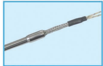
K1 Style: SS braided high temperature leads