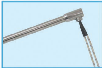
A3 Style: Right angle high temperature leads