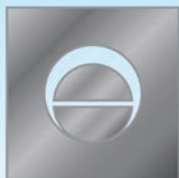
Unenergized Expandable Cartridge Heaters