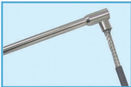
K2 Style: Right angle SS braided high temperature leads