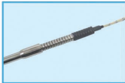
X1 Style: High-temp leads with armor-cable