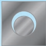
Energized Standard Cartridge Heaters

Expandable cartridge heaters have two legs that are joined together at the tip. The two legs are made from single tubular heater that has a semicircular cross-section. When Expandable heaters energize, the two semicircular legs expand with respect each other and press against the insertion hole wall.