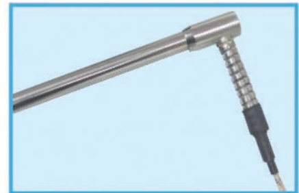
X2 Style: Right-angle high-temp leads with armor-cable