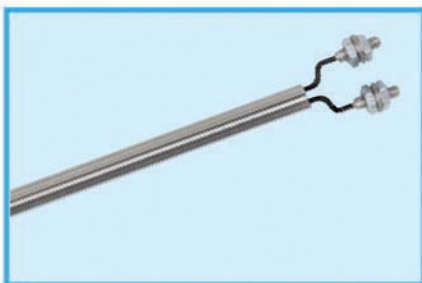
PT Style: Screw terminals