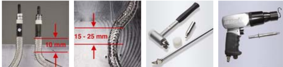
Tools recommended for ease of “Nextflex” tubular heaters installation